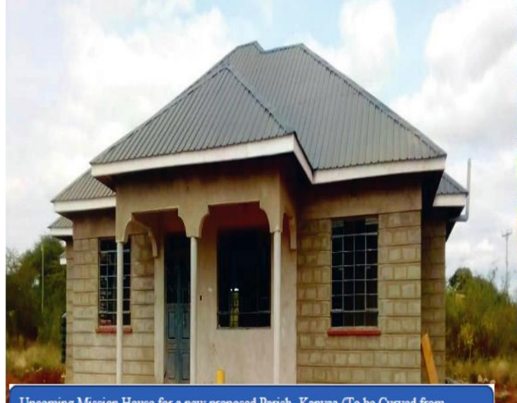
Upcoming Mission House for a new proposed Parish -Kanyaa (To be Curved from Migwani Parish)