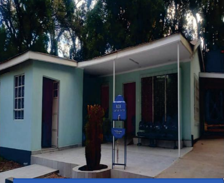
New Muthale Mission Satellite Hospital located in Kitui town