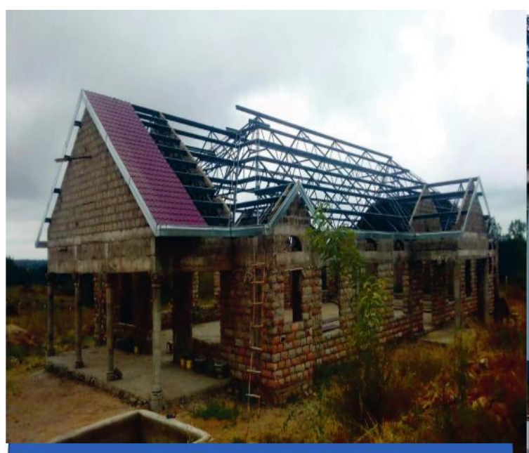
Upcoming Church of St. Francis of Assisi Kathivo – Outstation of Holy-Family Parish Kabati