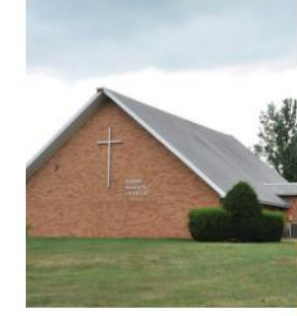
St. Mary 808 NW Pearl St, Atlanta

Mass times: Saturday 4:00pm Sunday @ 10:00am